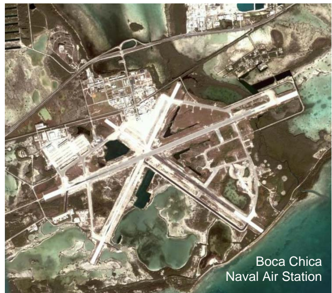
Boca Chica Naval Air Station