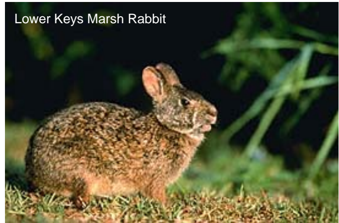
Lower Keys Marsh Rabbit

The construction firm gave SWC a 100% rating on performance of assigned tasks for this project.