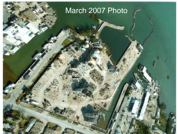
March 2007 Photo